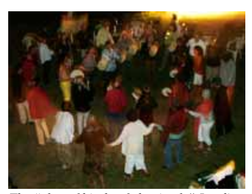
The "clan of big-hoofed animals" Leading the closing ritual of "the evening of expression".

I do not know if this description of my experiences can be of any help or interest to you. I hope it can. It took the "touch of Tuscany" and the being myself with the being of others to know, that "Being is approaching" - and that you are always here.