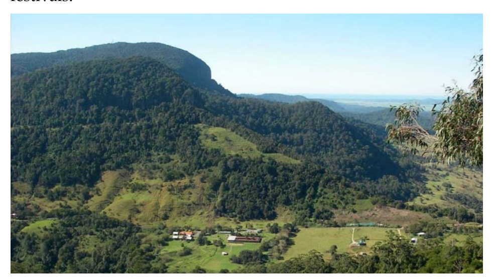
Illustration 1: Aerial View of Camp Bornhoffen

Venue: Camp Bornhoffen has been the main venue for Australian Imagery Festivals since 2001. We like it because of its peaceful and beautiful location in the Numinbah Valley and because the venue's energy is so conducive to imagery work. The area was traditionally a resting place for aboriginal people on their journey to the Bunya nut festivals.